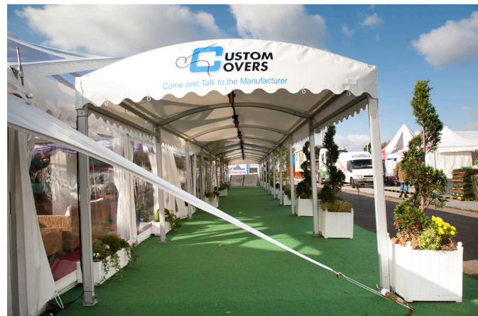
The 3m beam can also be used to create a walkway or an entrance