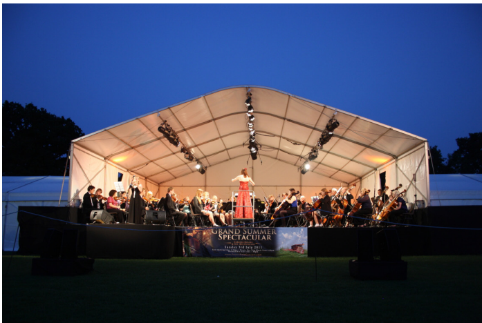
A Curved structure can double as an stage for outdoor performances