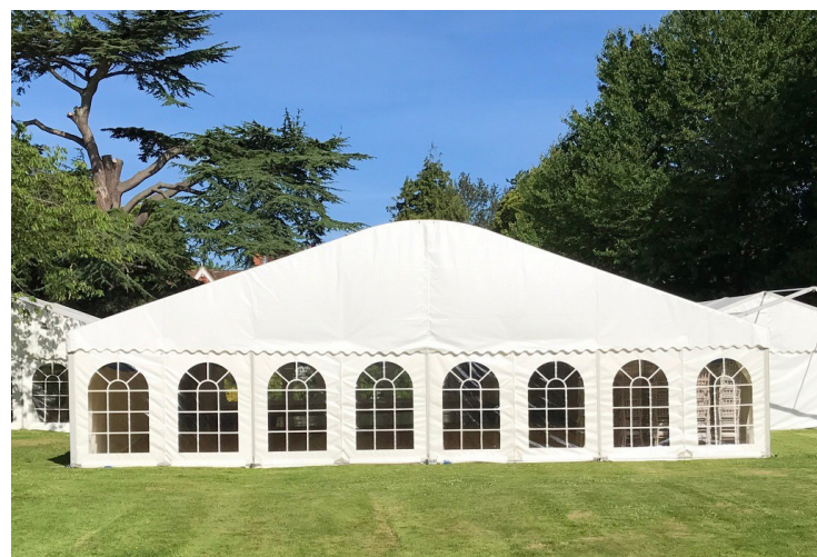
12m Curved Structure

For 3/6/9m frames the existing PVC roofs can be used however the curve is approx 75mm shorter than that of the classic frame. This means that the valance will hang lower.