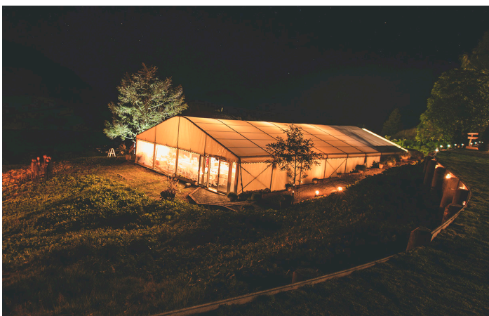
12m Curved Structure