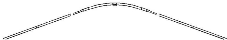
With Curved Roof Beam