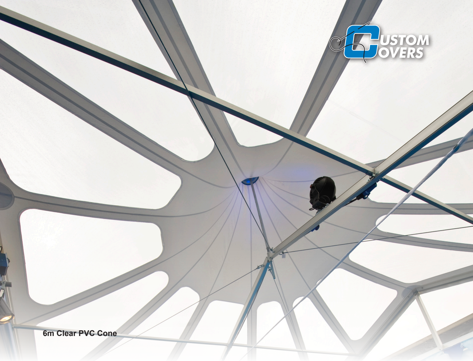
6m Clear PVC Cone

The Custom Covers CQ Cone is a cost effective way of bringing the elegance of a modern tensile structure to a Coverspan marquee.