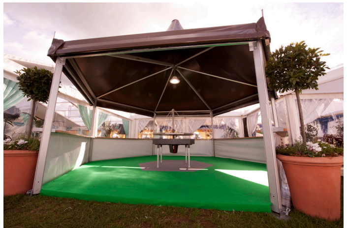
6m Hexagon Framework