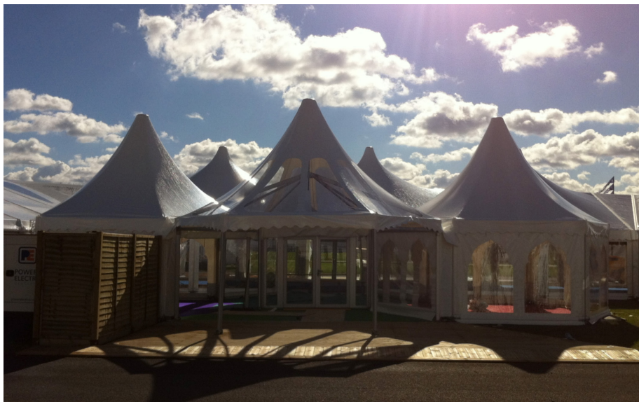
Three 6m Hexagons

INNOVATIVE DESIGN custom made with customers in mind