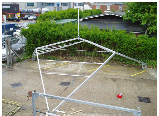
9m Tri-Cone Frame