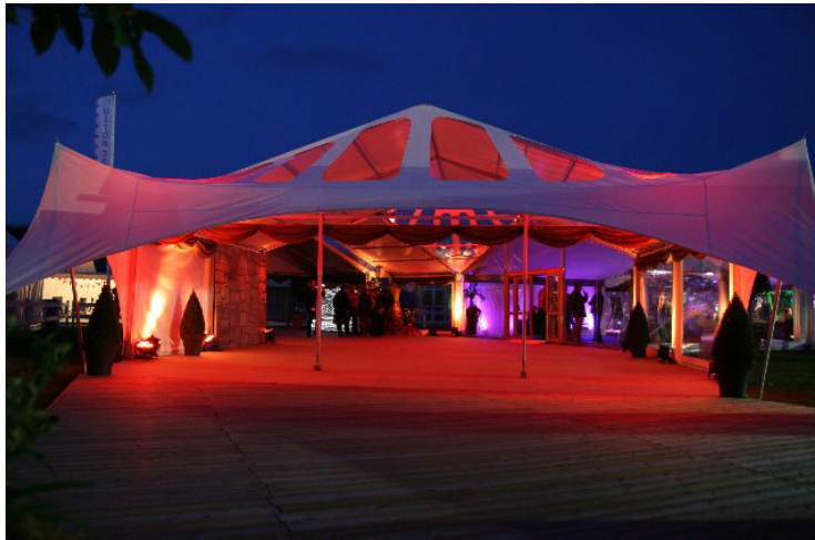
Solent Canopy at night