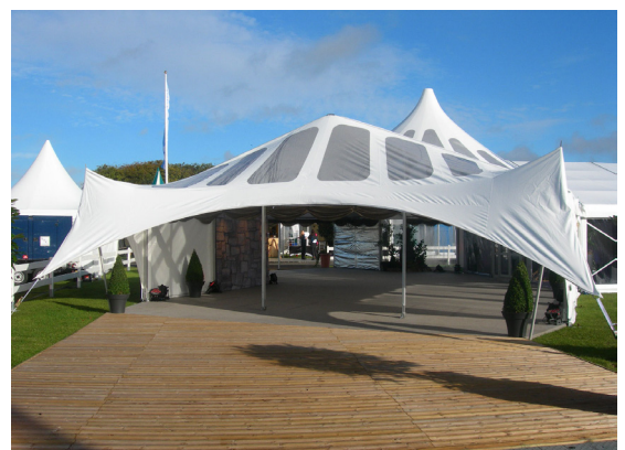
Solent Canopy Entrance