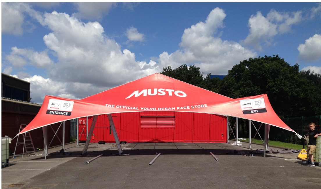
Solent Canopy in Red with Printing

INNOVATIVE DESIGN custom made with customers in mind