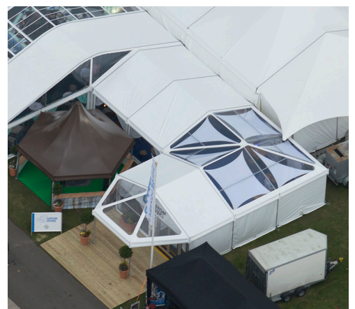
Right Angle Tent with Bell Extension