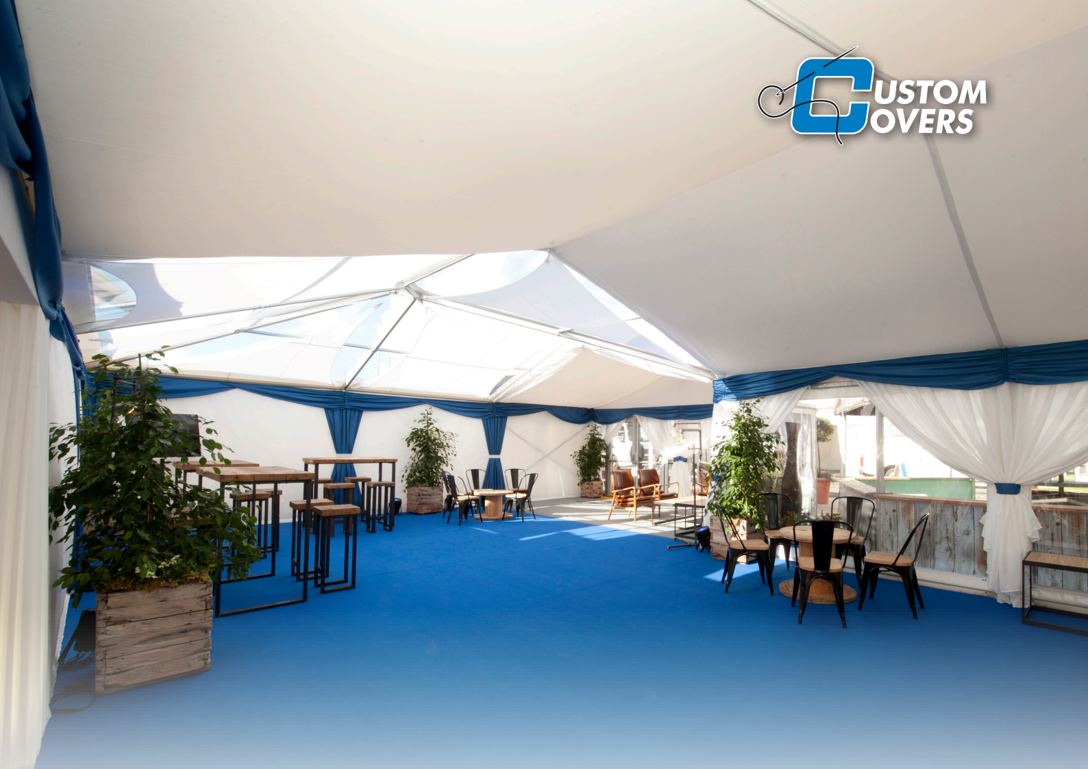
Right Angle Tent Internal

Turning corners has always presented a challenge to the aluminium framed marquees. Custom Covers can solve this by the use of a 90 deg frame package. The design incorporates as many standard parts as possible to minimise additional stock and to give a seamless transition around the corner.