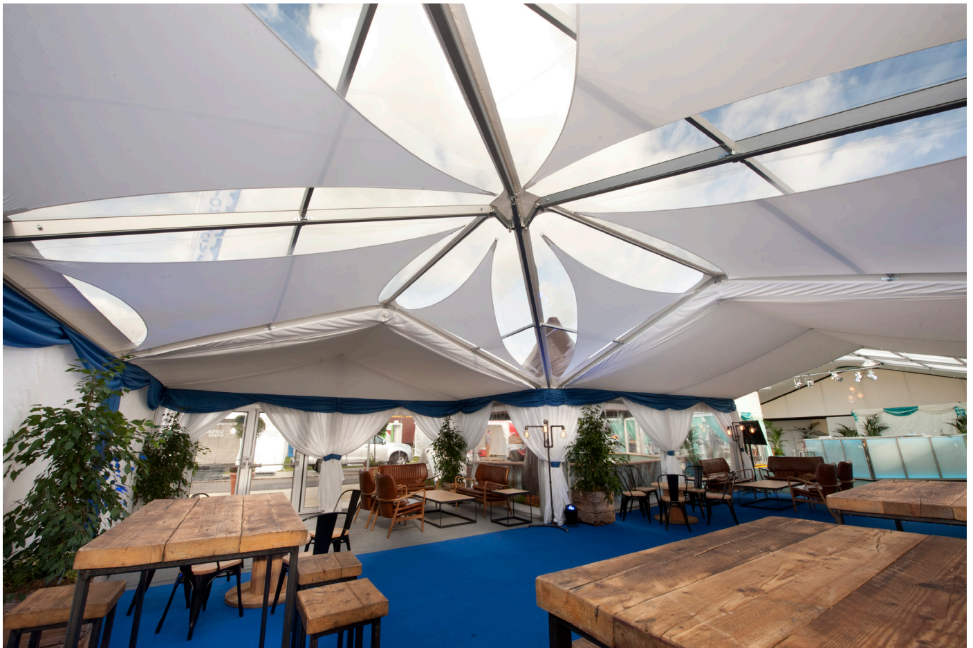
Right Angle Tent internal

INNOVATIVE DESIGN custom made with customers in mind