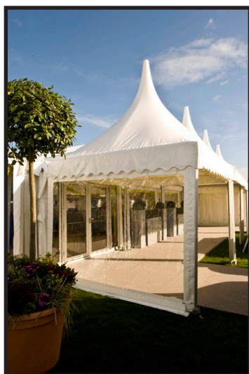
3m Romsey Pagoda