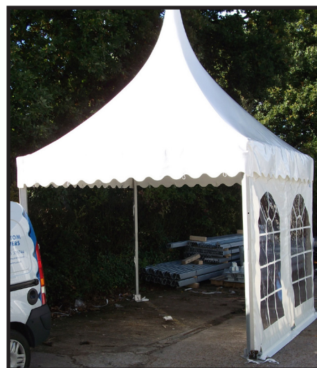
3m Romsey Pagoda