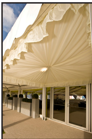
3m Romsey Pagoda Lining