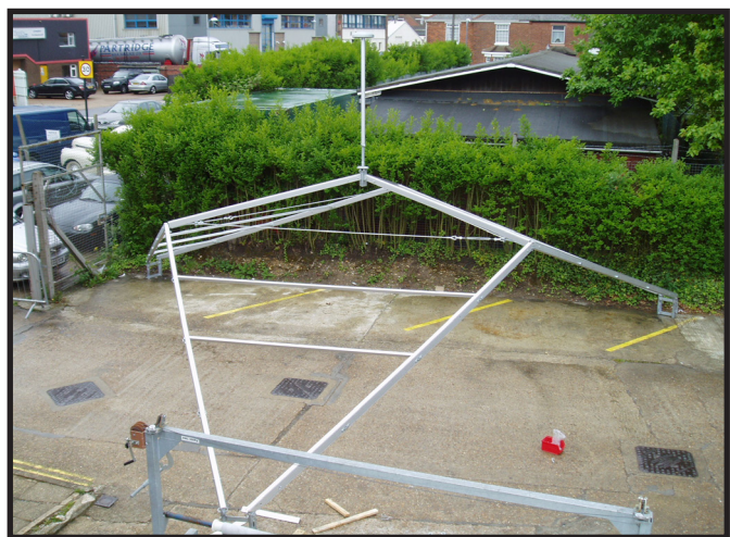
9m Tri-Cone Frame