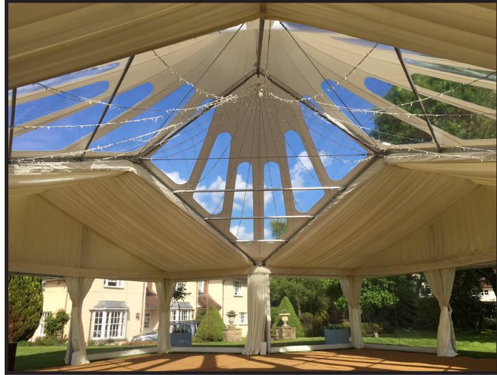
9m Tri-Cone Internal