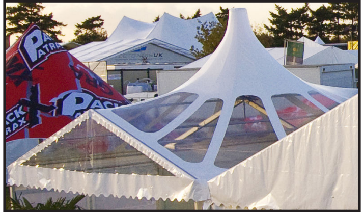
6m Clear Cone