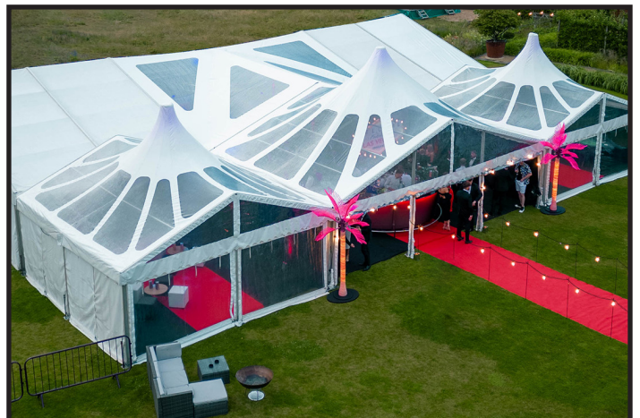
6m / 9m PVC Cones

INNOVATIVE DESIGN custom made with customers in mind