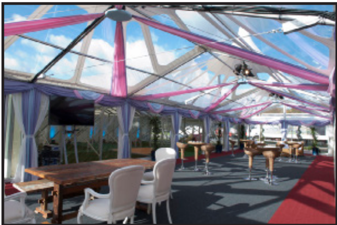
12m Cones with Hayling