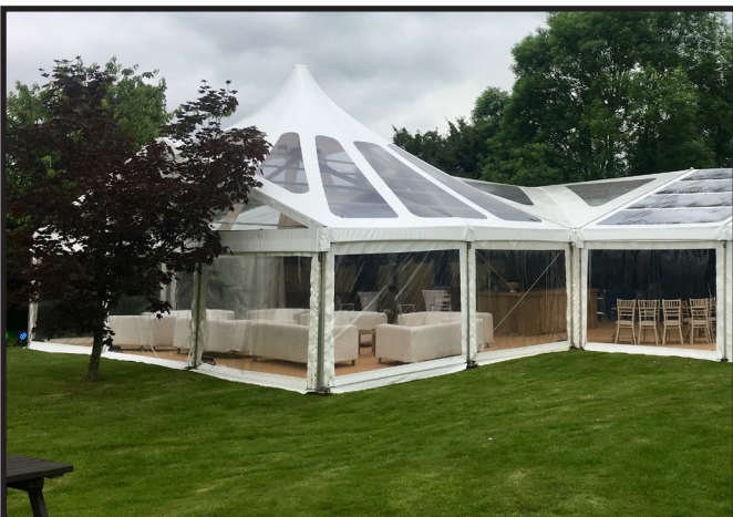
9m Clear PVC