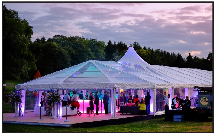
12m Clear PVC Cone with Bell