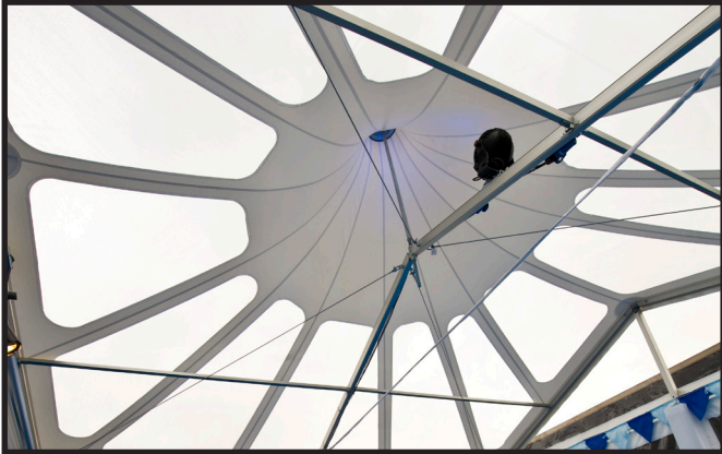
6m Cones Internal