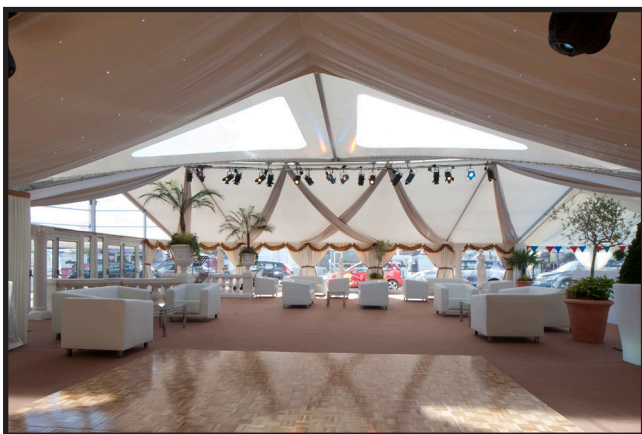
Cruciform with Flat Linings