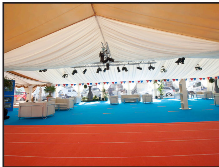
Cruciform with Flat and Pleated

INNOVATIVE DESIGN custom made with customers in mind