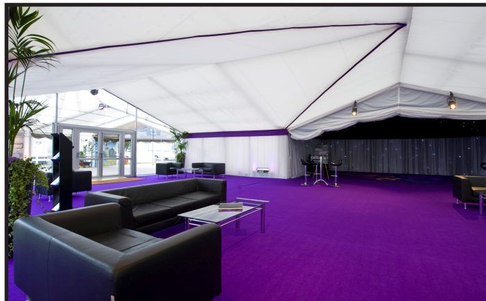
Cruciform with Flat White Linings