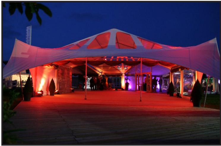
Solent Canopy at night