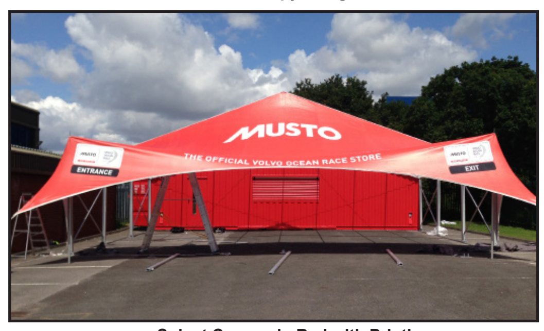
Solent Canopy in Red with Printing