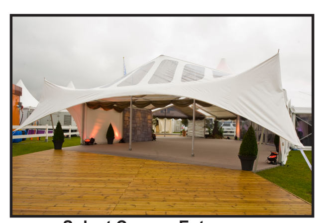
Solent Canopy Entrance