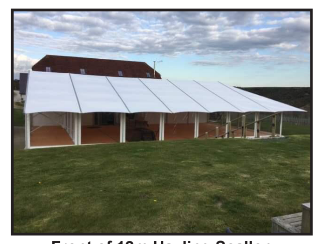
Front of 12m Hayling Scallop