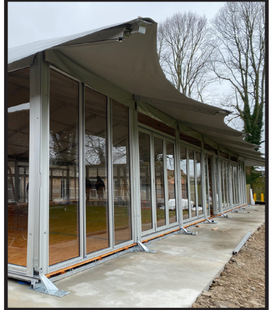
12m Hayling Scallop